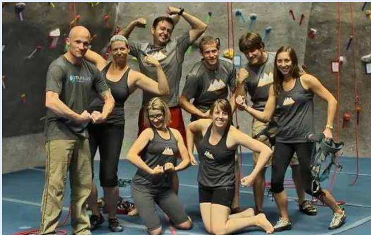
Welcome from the Reach Your Peak Team!

The TRUBLUE makes it easy to learn how to lead climb, work on your endurance, and improve your skills – all without a partner. The ability to climb safely alone makes it perfect to incorporate in a workout or fitness routine. Learn more about how the TRUBLUE can benefit climbers by visiting their website at www.autobelayer.com .